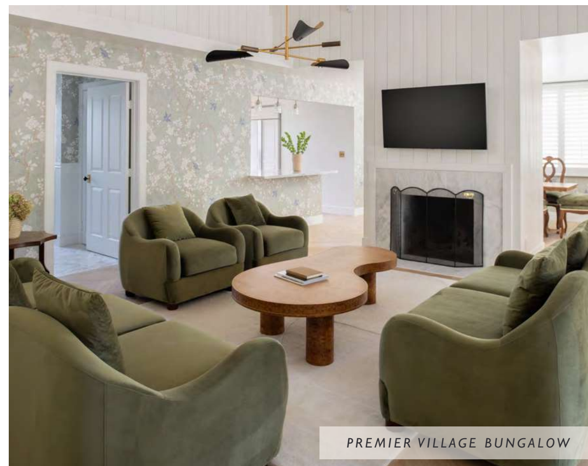
PREMIER VILLAGE BUNGALOW