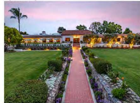
The Inn at Rancho Santa Fe's lush exterior.

As its complete renovation comes to a close, The heading into its centennial year. Here's your guide to San Diego's most exquisite new property that's elevating the Rancho Santa Fe community to great new heights.