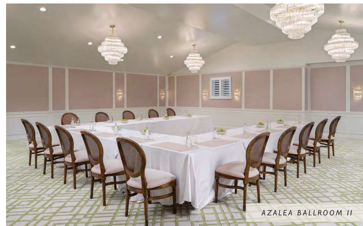
AZALEA BALLROOM II