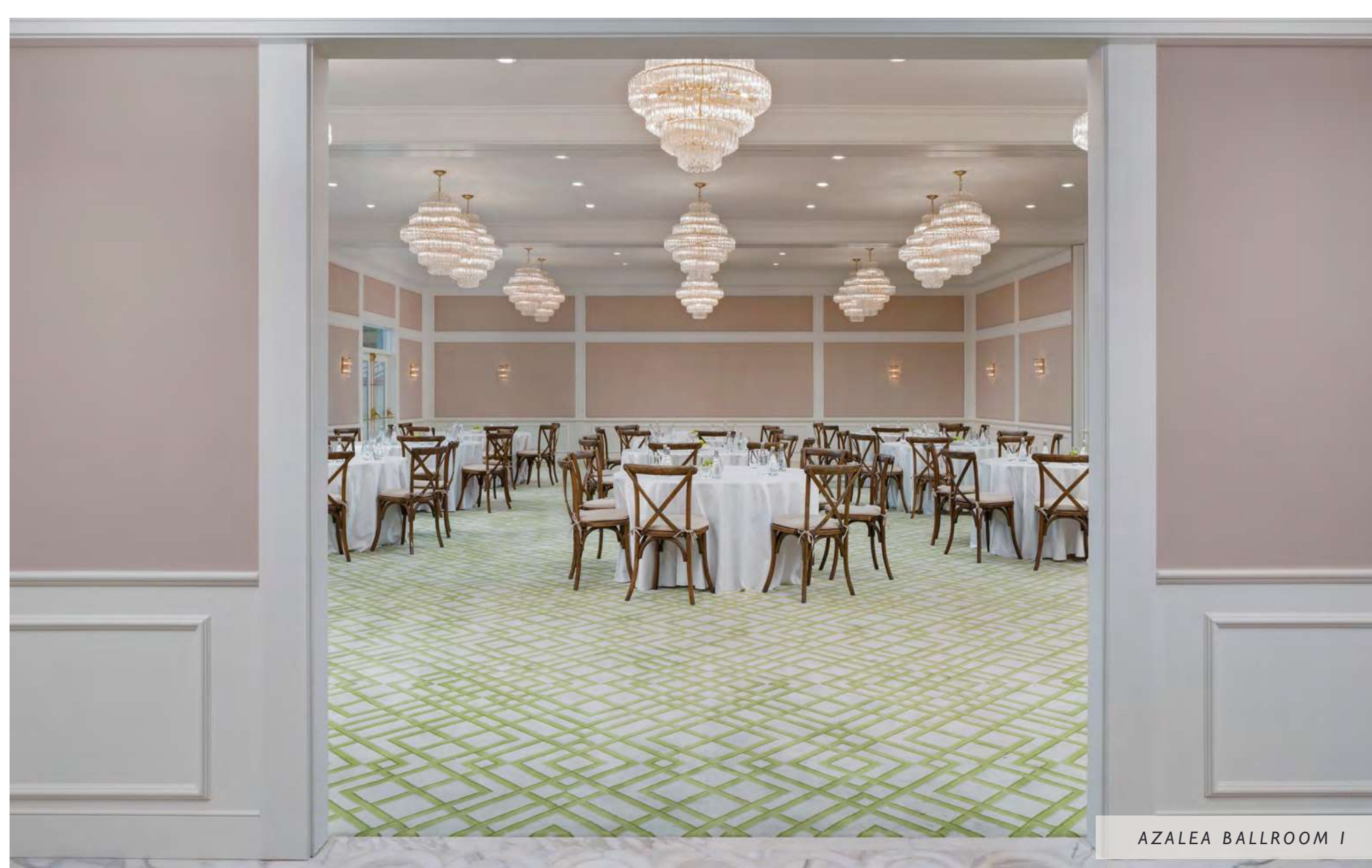
AZALEA BALLROOM I

Adjacent to Azalea Ballrooms I and II, the Azalea Lawn is 2,750 sq. ft. of vibrant sustainable turf surrounded by lush hedges for privacy. This garden-like setting can accommodate a tent and is ideal for up to 300 guests for a reception.